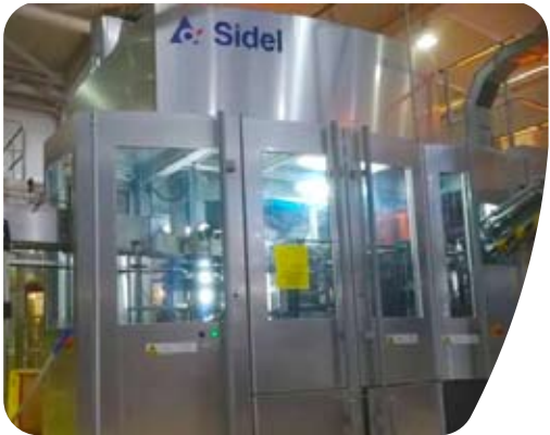
Preforms & Caps Moulding