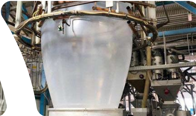
Recycling & Compounding