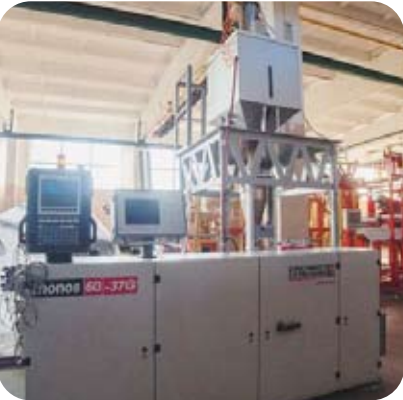
Thermoforming & Sheet